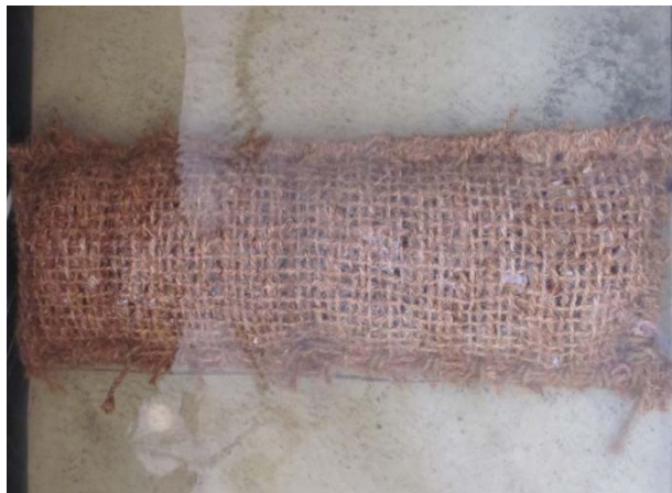
Figure 3 1 Tier oyster shell filled bag arrangement - unsecured (Phase 1 Tests)

through/over the structure was also measured to infer the likely reduction in foreshore erosion with the oyster shell bags in place. The bags were arranged in a pyramid fashion and tested with water levels corresponding to the top of each tier of oyster shell filled bags (where available). Photos of one tier and two tier oyster shell filled bag arrangements are shown in Figures 3 and 4, respectively.