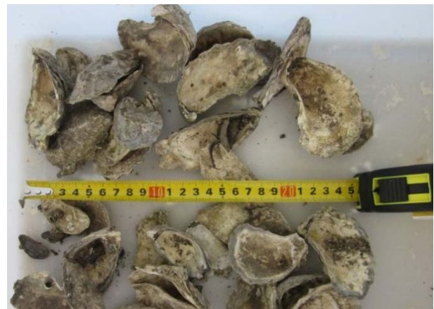
Figure 1 Sample oyster shells

The oyster shells used to fill the bags were a mix of Sydney rock oyster ( Saccostrea glomerata ) and Pacific oyster ( Crassostrea gigas ) shells (Figure 1). These empty shells were free of oyster tissue and subjected to biosecurity treatment. The average grain density of the mixed Sydney Rock and Pacific oyster shells was 2108 kg/m 3 [4].