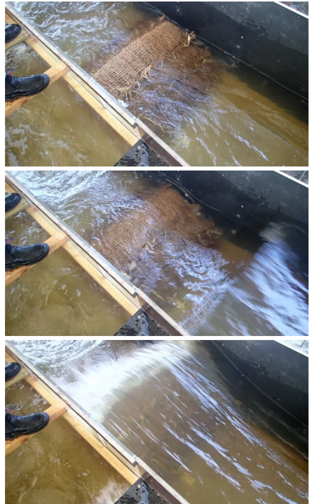
Figure 8 Wave attack on oyster shell filled bags during Phase 2 (3 tiers, WL = 0.40 m, T_p = 3 s, H_s = 0.28 m). Note – waves were travelling from right to left.

water depth). Example photographs of the oyster shell filled bags under wave attack during testing Phase 2 are presented in Figure 8.