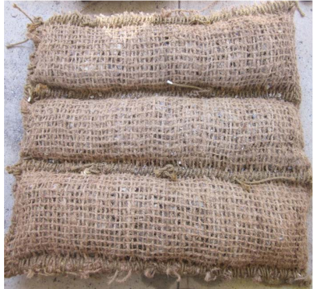
Figure 2 Example triple oyster shell filled bag

Each bag was measured and weighed (dry) prior to testing. Key measurements are summarised in Table 2. While the length of each bag was relatively consistent, their height and width were varied. Treating the bags as elliptical cylinders, bulk volumes were estimated for each bag. Dry bulk densities were inferred from these calculations with a range between approximately 330 and 450 kg/m 3 . Based on an average oyster shell grain density of 2108 kg/m 3 , the porosity of the oyster shell bags was approximately 80-85%.