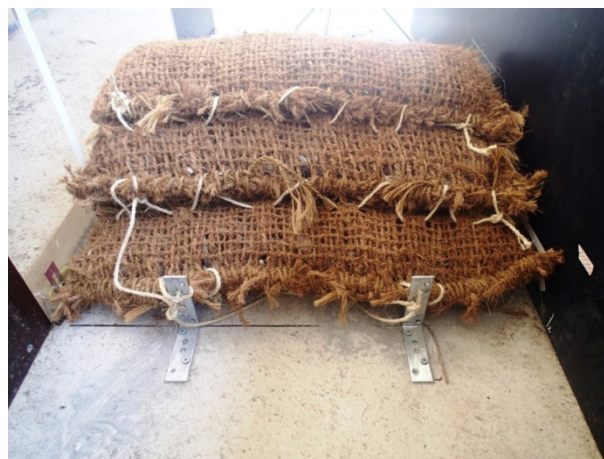
Figure 5 3 Tier oyster shell filled bag arrangement – secured (Phase 2 Tests)

Phase 2 tests were undertaken with 10 wave “packets” of monochromatic waves and irregular (random) wave spectrums of 26 minutes duration (~ 1,000 waves). For this phase, the oyster shell filled bags were anchored to the bed and secured together. Their movement while tethered together was monitored but wave transmission was not recorded. A photo of the anchored three tier oyster shell filled bag arrangement is shown in Figure 5.