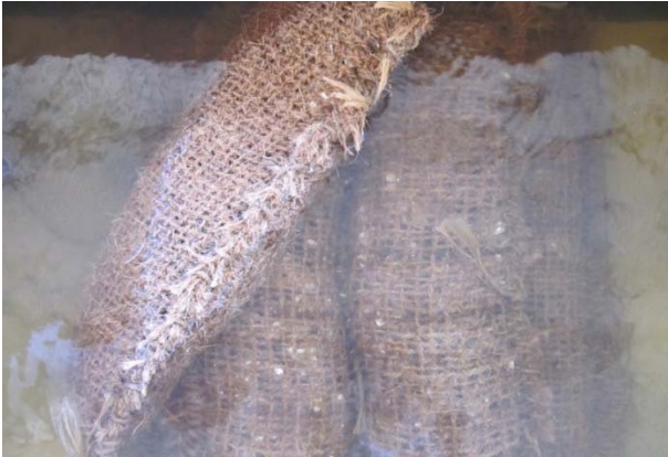
Figure 7 After complete displacement of crest bag (3 tiers, WL = 0.40 m, T = 2 s, H = 0.18 m). Note – waves were travelling from right to left.