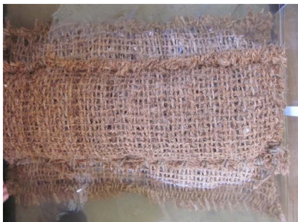
Figure 4 2 Tier oyster shell filled bag arrangement - unsecured (Phase 1 tests)

Phase 2 tests were undertaken with 10 wave “packets” of monochromatic waves and irregular (random) wave spectrums of 26 minutes duration (~ 1,000 waves). For this phase, the oyster shell filled bags were anchored to the bed and secured together. Their movement while tethered together was monitored but wave transmission was not recorded. A photo of the anchored three tier oyster shell filled bag arrangement is shown in Figure 5.